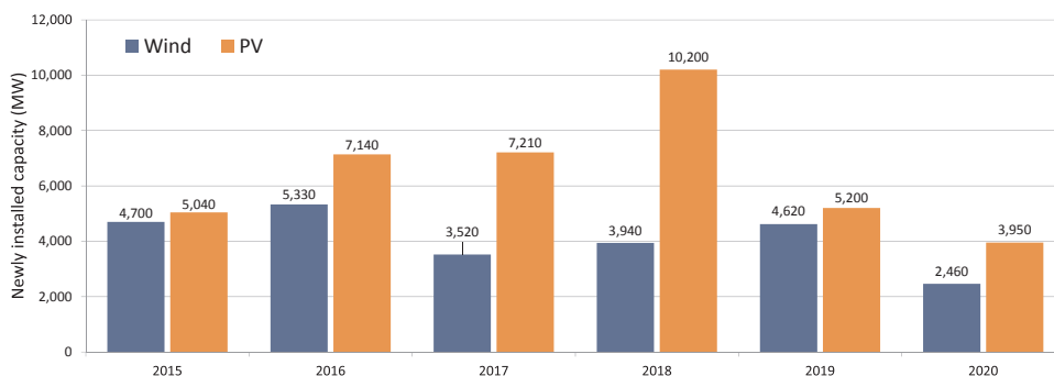
Fig. 3. Chinese newly installed capacity of wind and PV (MW) in the first quarter of each year.

Investment in long-lived high-carbon energy infrastructure, on the other hand, continues on a massive scale. Local authorities approved 48 GW of coal-fired power plants in just the first five months of 2020 already (Nengyuan Energy Magazine, 2020), after